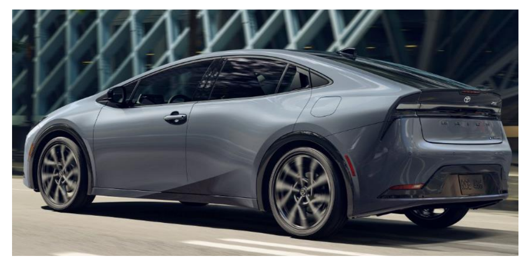
Prius Prime – Available in the Contra Costa County $46,000+taxes etc.