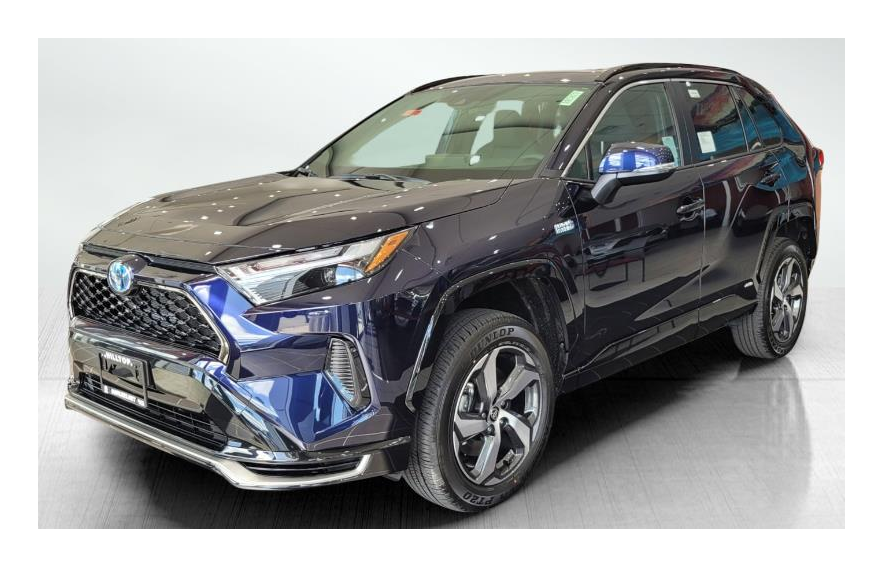
2024 RAV 4 Prime SE— Available in the Contra Costa County $50,000+taxes etc.